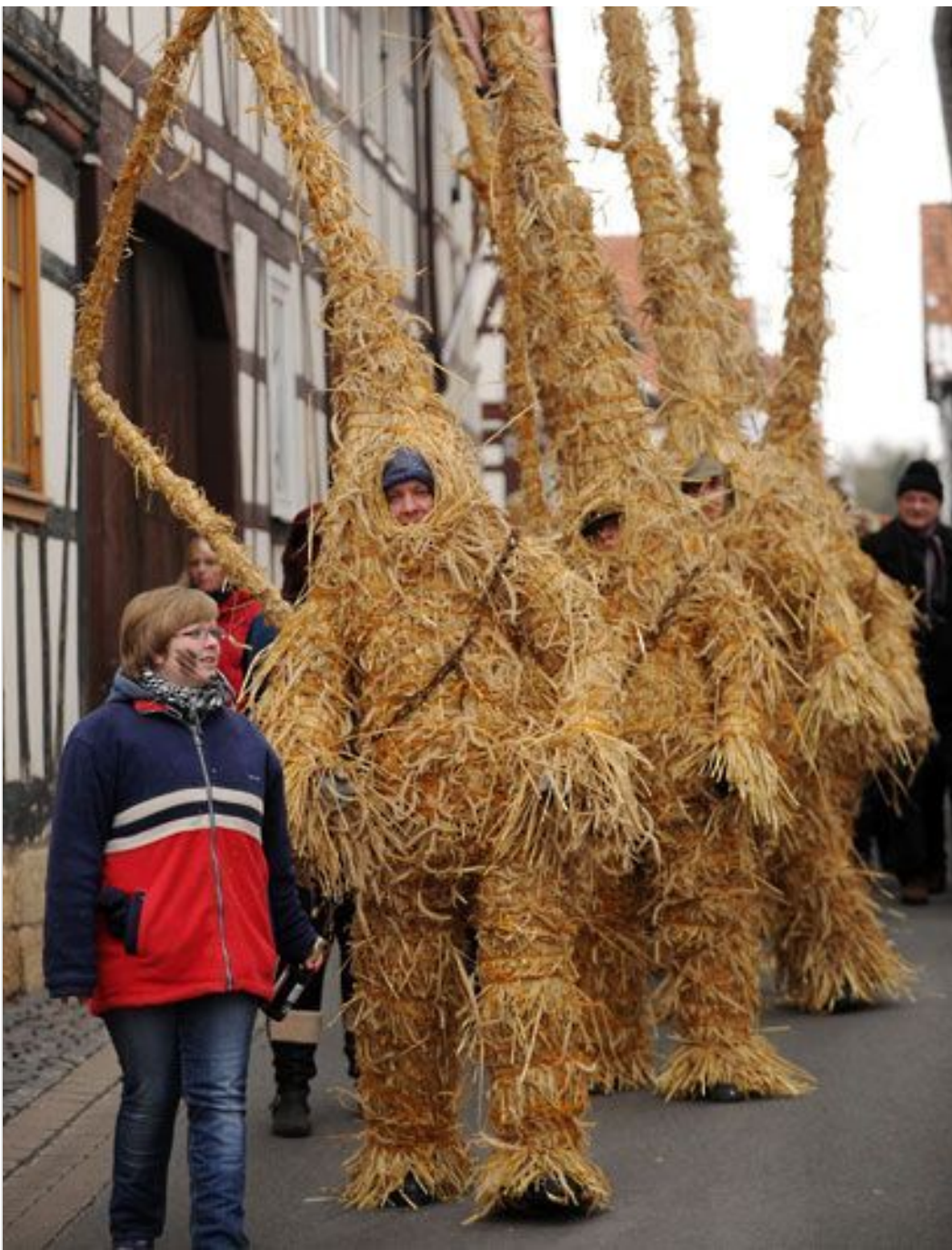
Kirkwall, Ηνωμένο Βασίλειο